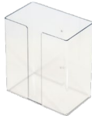
ACRYLIC GLOVE BOX HOLDER Mounts onto base without hardware. Item 22151 | 5x5Wx3.75Dx10H Madera Version | 22151-99