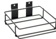
WIPE BOX BRACKET Mounting hardware included. Item 22158-B | 8Wx8Dx2H