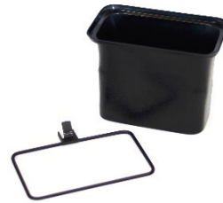
WASTE BIN & BRACKET Mounting hardware included. Bin - Item 22160-13 | 10Wx5Dx8H Bracket - Item 22160-B | 10Wx6D