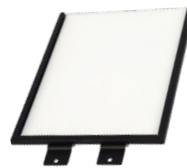
8.5x11 SIGN HOLDER Mounting hardware included. Item 22159-811-13 | 8.5Wx11H