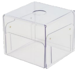
ACRYLIC WIPE BOX HOLDER Mounting hardware included. Item 22158-12 | 6.75Wx6.75Dx10H