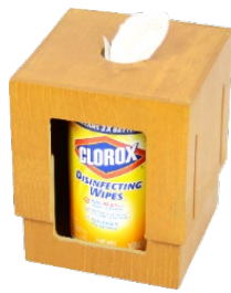
MADERA WIPE BOX HOLDER Mounting hardware included. Item 22158-99 | 6.75Wx6.75Dx10H

CHOOSE YOUR ADD-ONS FROM OUR A LA CARTE SELECTION (EACH PIECE SOLD SEPARATELY)