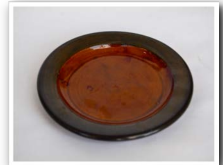
HONEY OVER MATTE BLACK