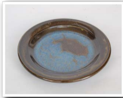
L. BLUE LAGOON