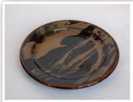
TEMMOKU STRAW SPLASH