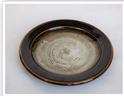
TEMMOKU WHITE BRUSH